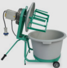
Mix 60 / Mix All

HIGH PERFORMANCE PADDLE MIXERS FOR MIXING BOTH CONVENTIONAL AND PRE-MIX MATERIALS IN PAN OR BUCKET