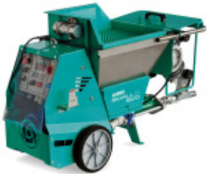
Small 50 Evo

PUMP AND SPRAY WET MIXES, INJECTIONS AND GROUTING