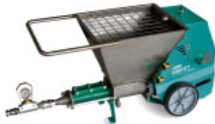
Mighty S50 Plus