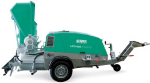
Mover 270d EVO

PUMP SAND OR SCREEDS OVER 200m HIGH AT 50m 3 / SHIFT