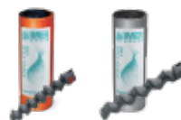
Rotors and Stators