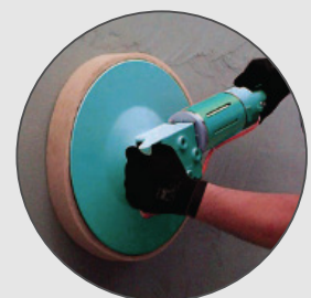
Plaster smoothing Plaster sanding