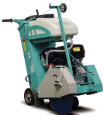
Terra 450 / 500

Option of Honda or Kohler make Petrol or Diesel engines