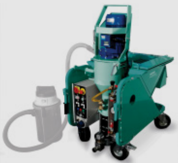
Koine 4 HF

PUMP SELF-LEVELLING OR GROUTS AT 40m 3 / SHIFT