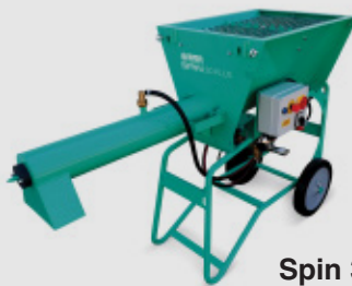
Spin 30 plus